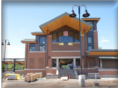
Construction at Berlin Station