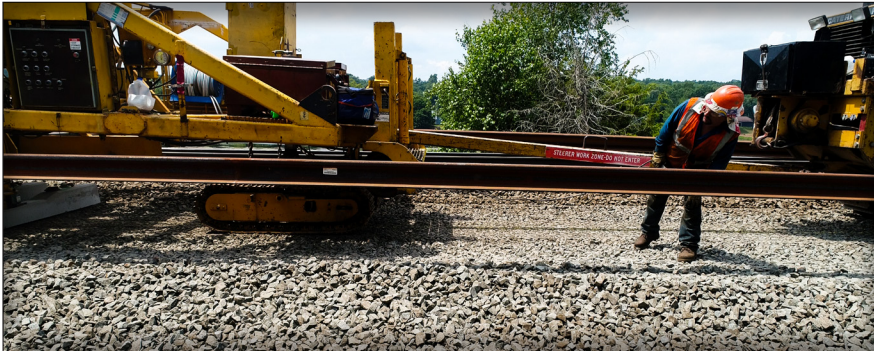
Track Construction Machine laying new track in Berlin