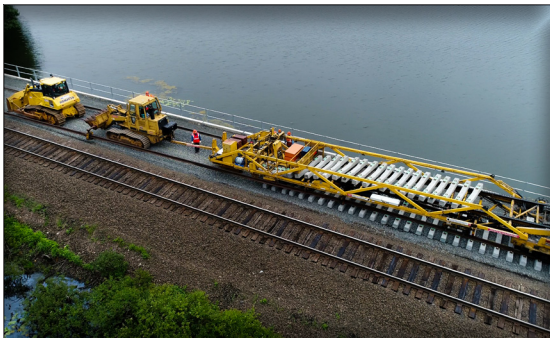
TCM installing new track in Berlin