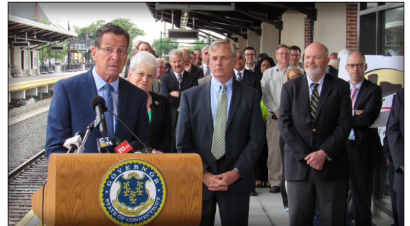
Gov. Malloy making Hartford Line announcement at the future Wallingford Station.

When service begins, the line will more than double the daily round trips currently offered in the corridor, providing more frequent, convenient, and faster rail service to those living, working, and traveling through central Connecticut. Since the start of his administration, Governor Malloy has been working to develop commuter rail service along the New Haven-Hartford-Springfield corridor, saying that a more active rail line in the region is crucial to making more livable communities, attracting businesses and job growth, and keeping the economy moving.