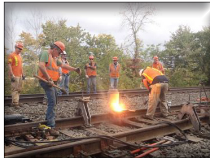
Welding along the track in North Haven