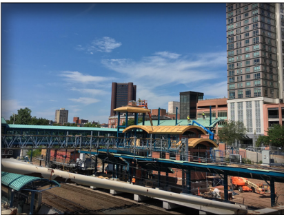
Construction at State Street Station in New Haven