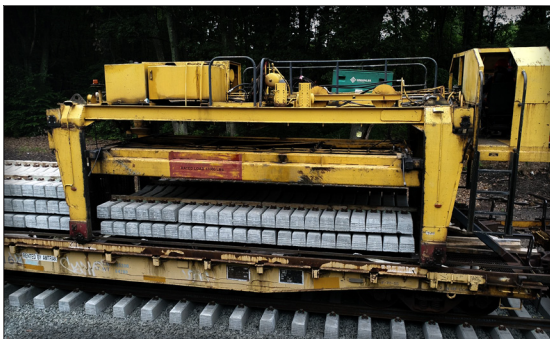
TCM installing new track in Berlin

The Track Construction Machine (TCM), which debuted in October 2016 to double-track portions of the New Haven-Hartford-Springfield (NHHS) rail corridor, returned this summer to install nine additional miles of track in the Newington and Berlin area. It will return this fall to install the remaining four miles of track between Hartford and Windsor.